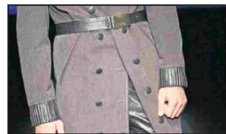
ATTENTION TO DETAIL: A model in a design by Nake Ape